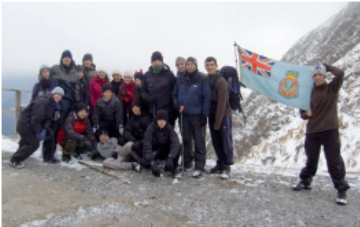
The Cadets at 2122m, on top of the Marinelli Peak

first British youth group to complete an expedition in the Carnic Alps, Italy.