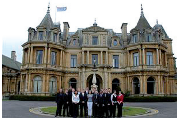
The camp outside Halton House, Officers' Mess