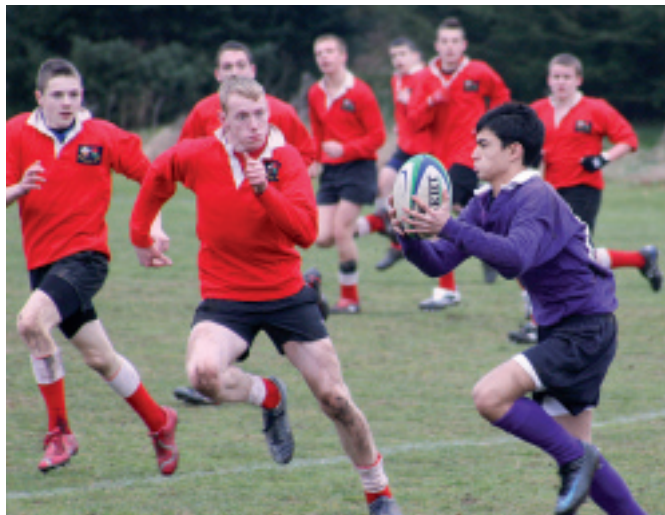
Going for a try