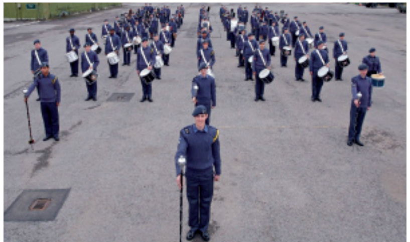
The Region Band