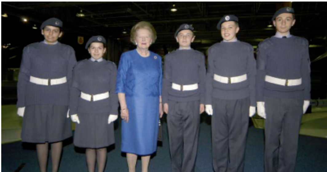
Cadets with Baroness Thatcher

Cadets from 120 (Hendon) Squadron were tasked to provide a Guard of Honour for the opening of the Chinook Exhibition at the Royal Air Force Museum last year.