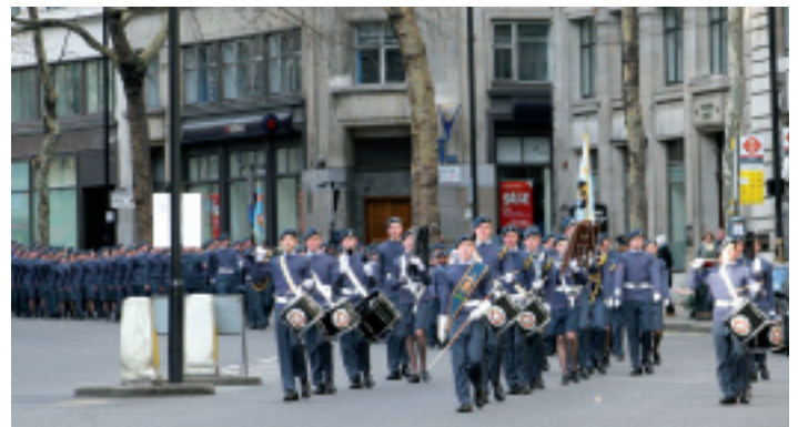
The parade approaching St Clement Danes